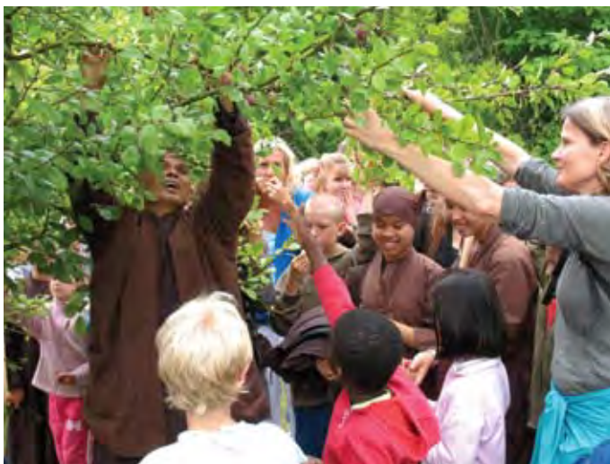
Picking plums with students at Plum Village meditation center in southern France.